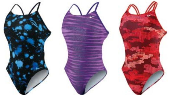
Featured Suits: Splatter, Foil Skin and Techno Camo

Take a look at each of these awesome two-year print suits featured here: